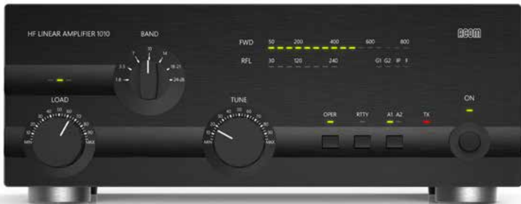
Fig. 3-1 ACOM1010 Display and Control

Note that the upper LED bar-graph always reads peak forward power, except for the service functions (Section 5-5). The 800 W-scale resolution is 50 W. Note also that levels below 50 W may be not detected.